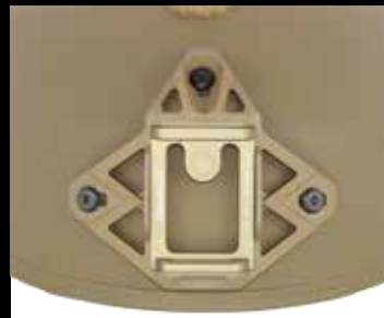
WILCOX® INTEGRATED SHROUD