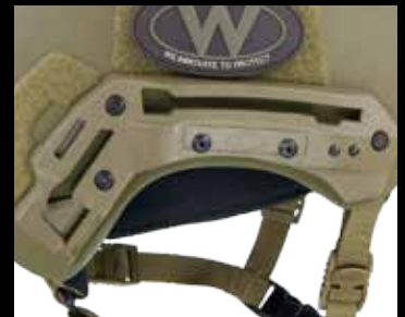
ACCESSORY RAIL 2.0