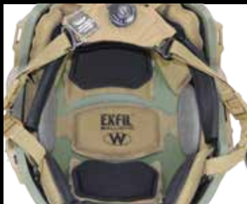
TEAM WENDY PAD SYSTEM