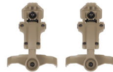
(2) Rail Mount Arms