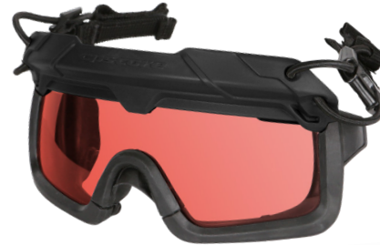
Ops-Core STEP-IN Visor with Laser Dazzle lens and replacement lens

Dazzle Laser Eyewear blocks the most common blue and green commercial laser threats. Key protection comes from special absorbing optical-dye and lens coating technology, which shields users from hazardous reflected or scattered laser light. It blocks common CI Class 2, 1-5mW blue and green laser light wavelengths.