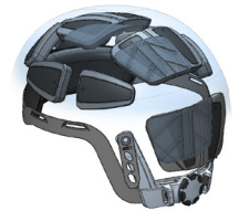
Comfort Layer Option