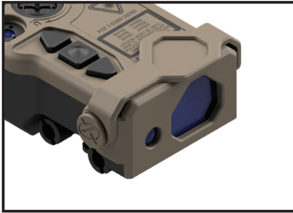
PRODUCT ILLUSTRATED** WITH LASER SAFETY COVER ASSEMBLY (COVER OPEN)