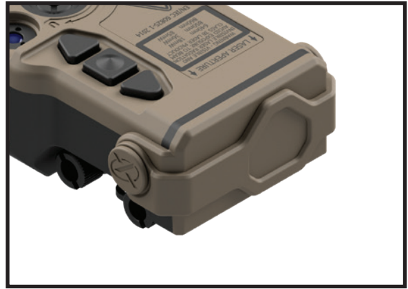
PRODUCT ILLUSTRATED** WITH LASER SAFETY COVER ASSEMBLY (COVER CLOSED)