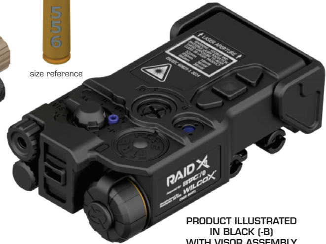
PRODUCT ILLUSTRATED IN BLACK (-B) WITH VISOR ASSEMBLY (VISOR CLOSED)