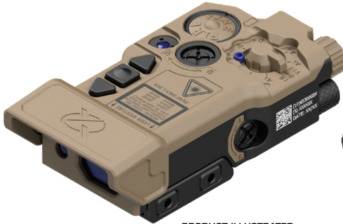
PRODUCT ILLUSTRATED IN COYOTE (-C) WITH VISOR ASSEMBLY (VISOR OPEN)

RUGGEDIZED AIMING/ILLUMINATION DEVICE - ENHANCED - HIGH POWER