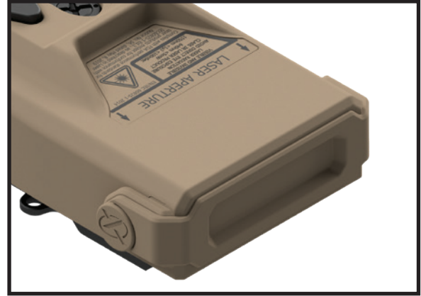
PRODUCT ILLUSTRATED WITH LASER SAFETY COVER ASSEMBLY (COVER CLOSED)