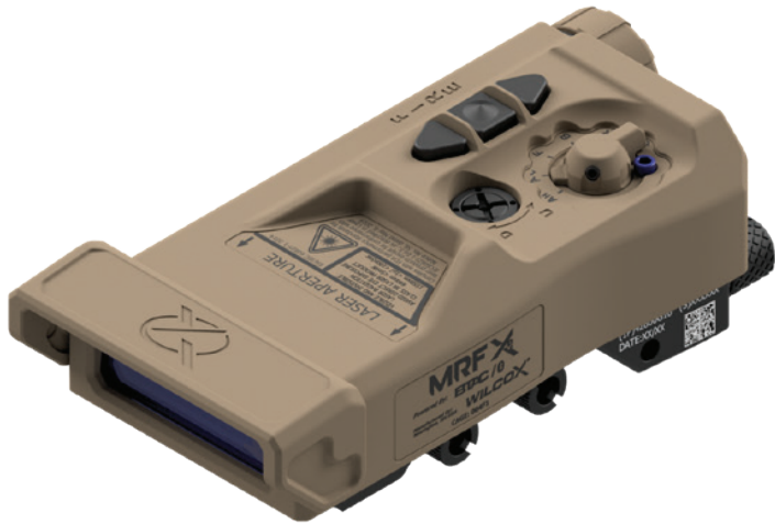
PRODUCT ILLUSTRATED IN COYOTE (-C) WITH VISOR ASSEMBLY (VISOR OPEN)