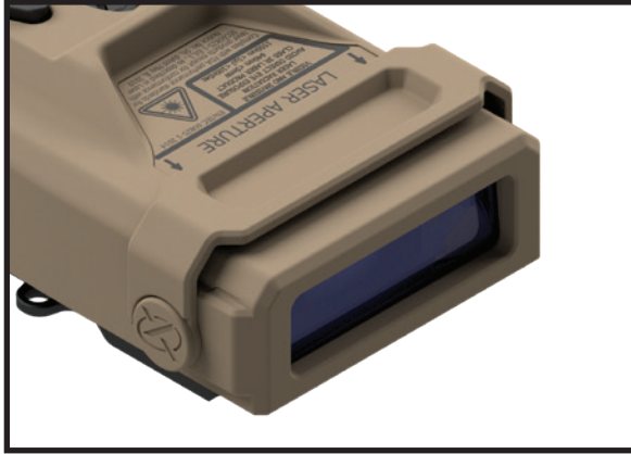
PRODUCT ILLUSTRATED WITH LASER SAFETY COVER ASSEMBLY (COVER OPEN)